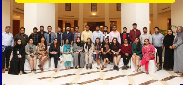
EPGDIB-2021-22 Port visit at Dubai, UAE