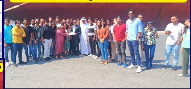
EPGDIB 2023-24 during the Port visit Antwerp, Belgium