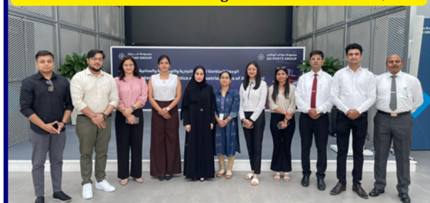
EPGD-GHRM 2022-24 during the Port visit at Dubai, UAE