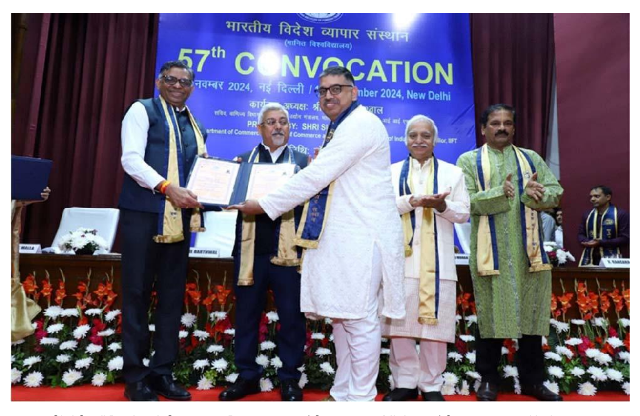
Shri Sunil Barthwal, Secretary, Department of Commerce, Ministry of Commerce and Industry, Government of India, awarded Degree at 57<sup>th</sup> Convocation on 11<sup>th</sup> November 2024.