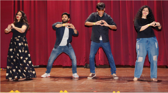
"Reliving College Life"