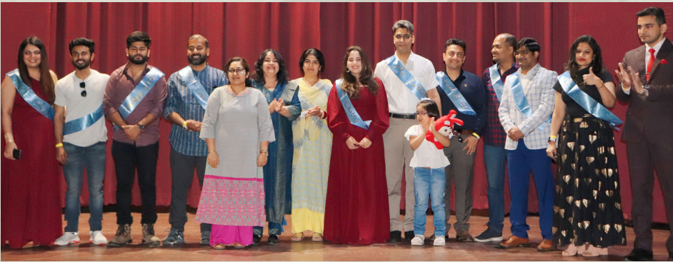
Celebrating Excellence: Awards and Recognition