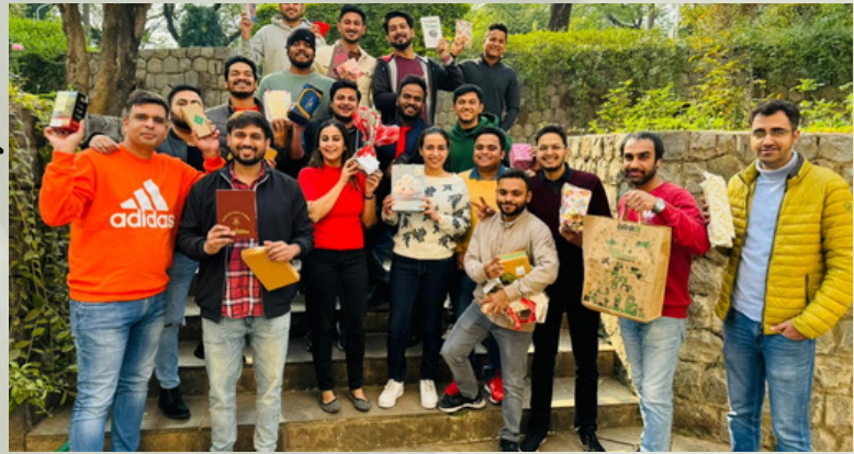
"Unveiling Your Secret Santa: Celebrating Christmas in Style!"