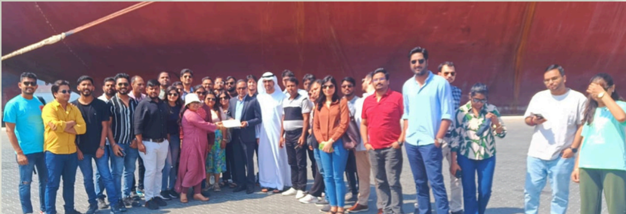
A Batch of EPGDIB during Dubai Port Visit

Comprehensive Curriculum: The Post Graduate Certificate in Management - International Business offers a twelve months program focusing on international business management. Designed to nurture a cadre of proficient business executives, the program addresses industry and governments increasing demand of skilled professionals in the realm of International Business Management. With a keen awareness of the impact of global developments on domestic markets, the curriculum provides extensive coverage of pertinent subject areas and disciplines.